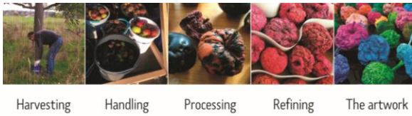
Harvesting Handling Processing Refining The artwork